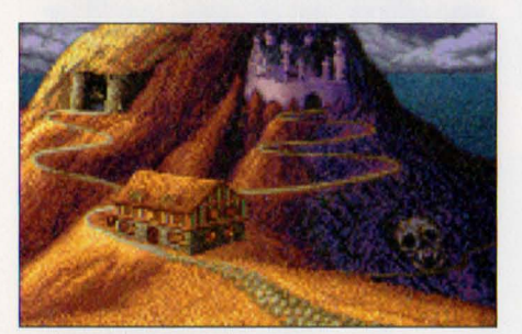
The opening screen lets you enter the various areas of Twinion.

TSN's Yserbius was designed to be enjoyable and challenging to players of all skill levels. Choosing from eight races and six guilds, the player creates a character and journeys through the halls and rooms of the volcano Yserbius. Travelling either