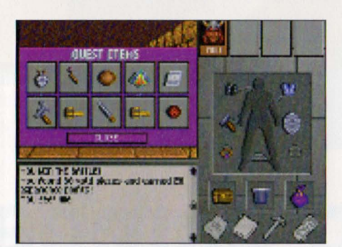
Check your inventory! What you buy, find or win can keep you alive.

hatch evil plots to oust the invaders. There are other entities, however, which can teach the characters new skills, thus helping them to advance. Experience points can also be applied to improve the characters' magic spells.